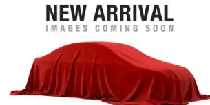
2022 Honda CR-V EX SUV $31,635