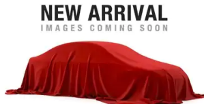
2022 Honda CR-V EX SUV $32,030