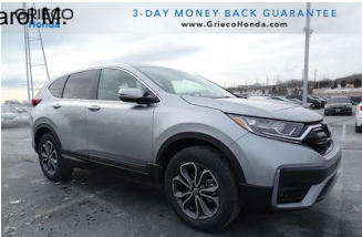
2022 Honda CR-V EX SUV $31,635