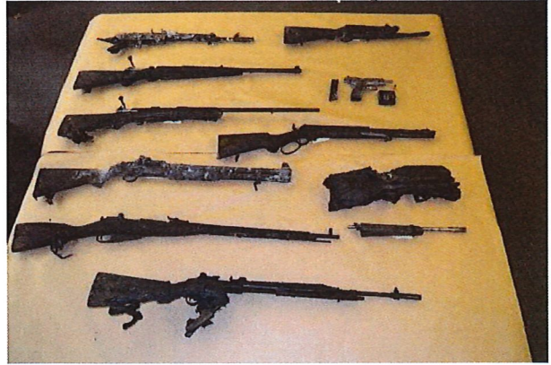
Firearms seized from 25 Denison Street