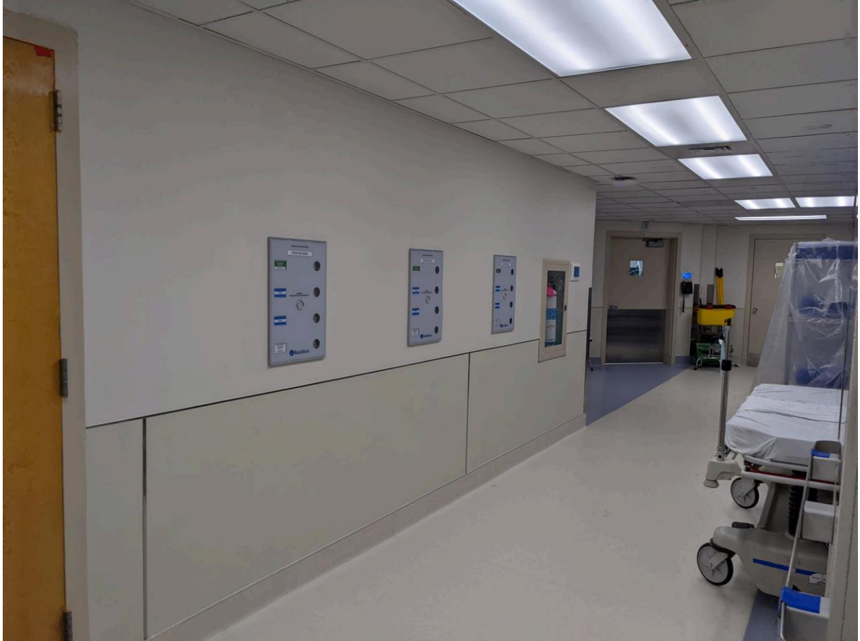
Exhibit 2.4 Interior view – Roger Williams Medical Center