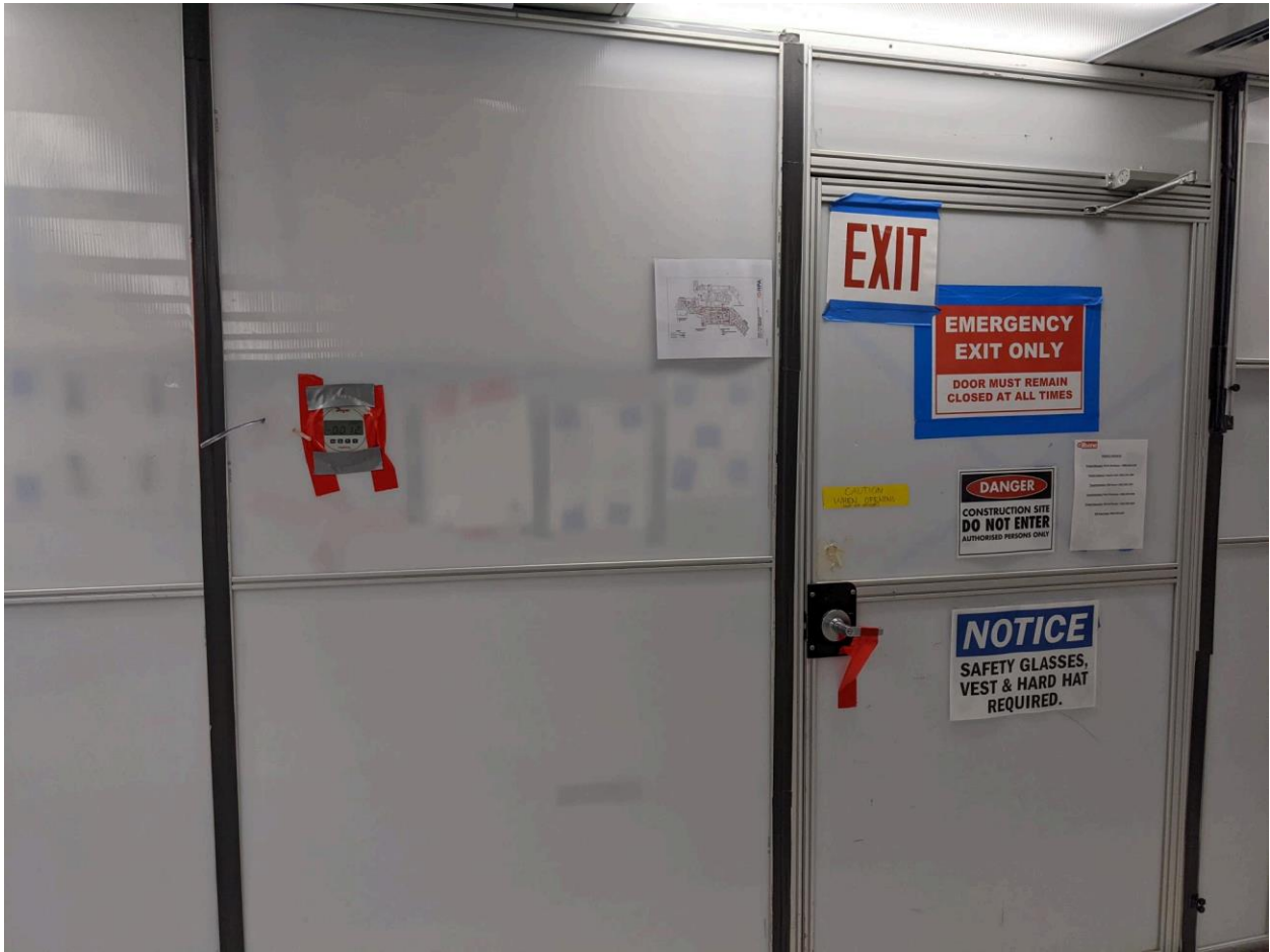
Exhibit 2.6 Interior view – Intensive Care Unit at Roger Williams Medical Center