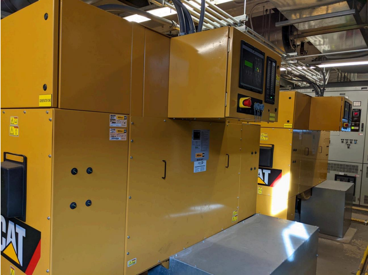
Exhibit 2.10 Interior view – emergency generators at Our Lady of Fatima Medical Center