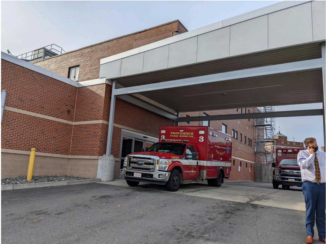
Exhibit 2.1 Exterior view – Emergency entrance