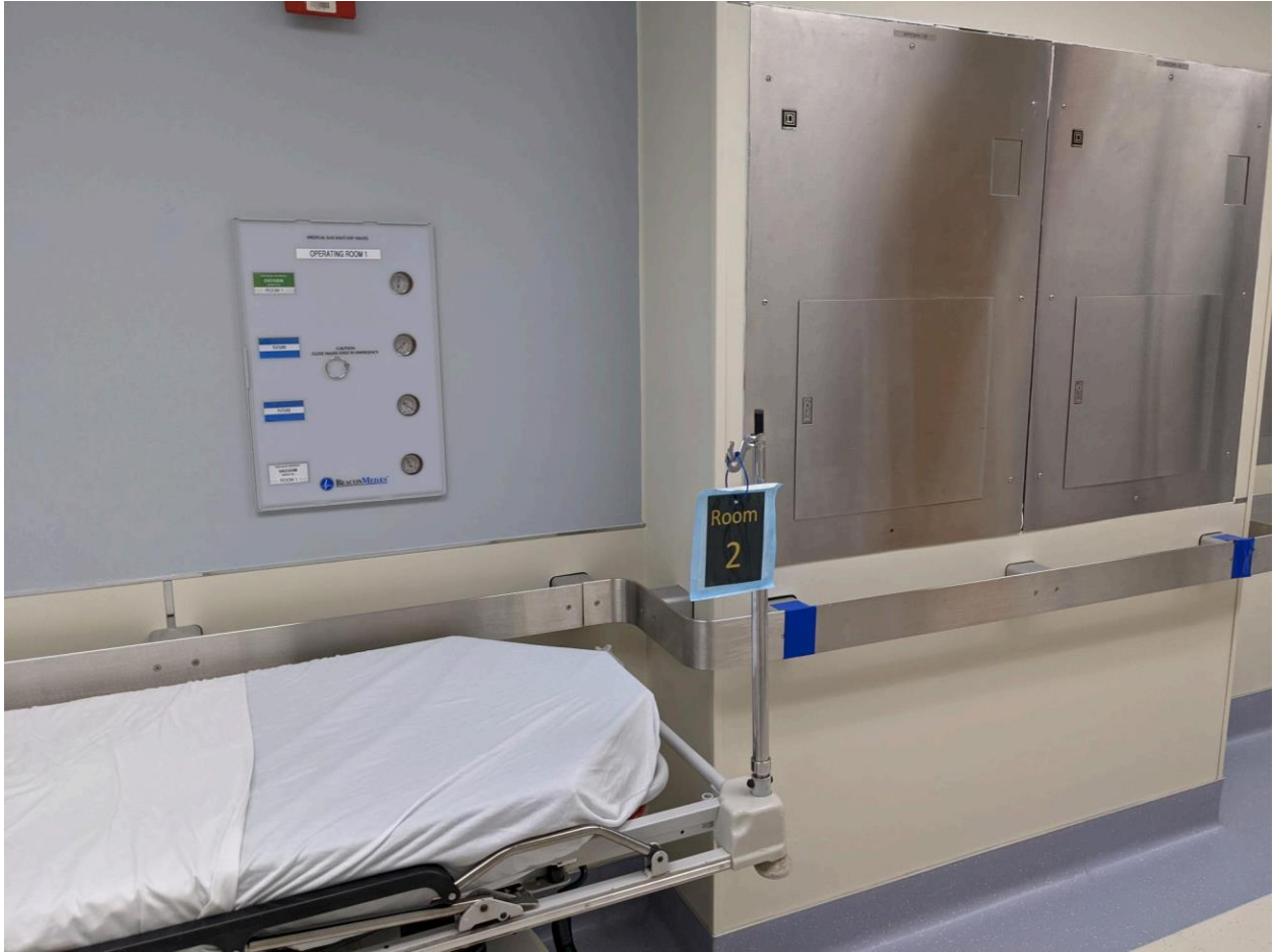
Exhibit 2.5 Interior view – Roger Williams Medical Center