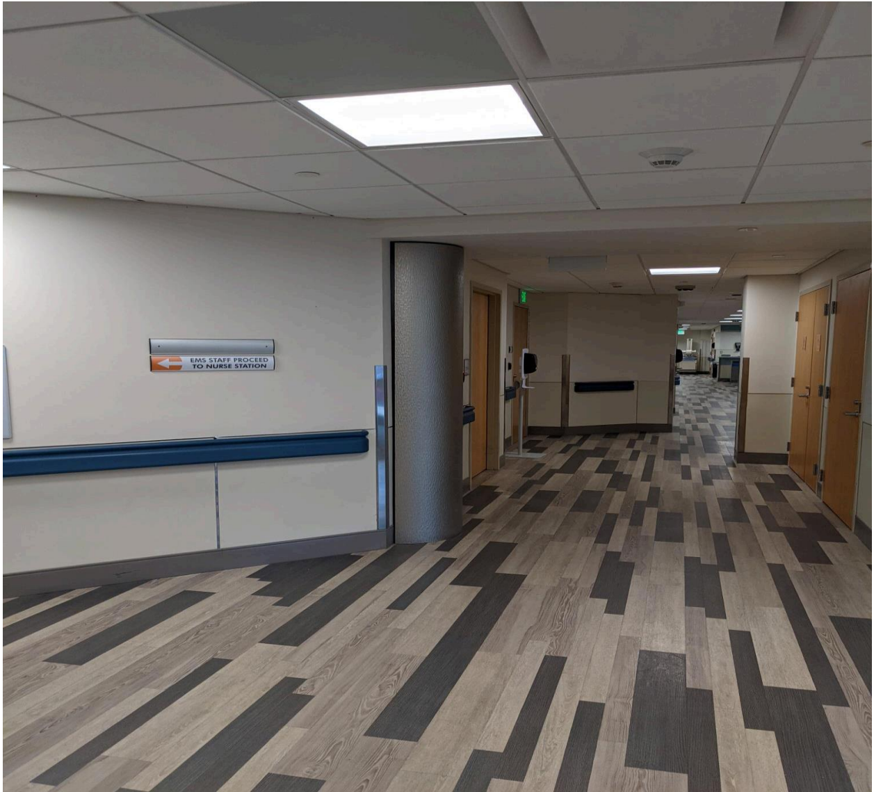
Exhibit 2.2 Interior view – hallway at Roger Williams Medical Center