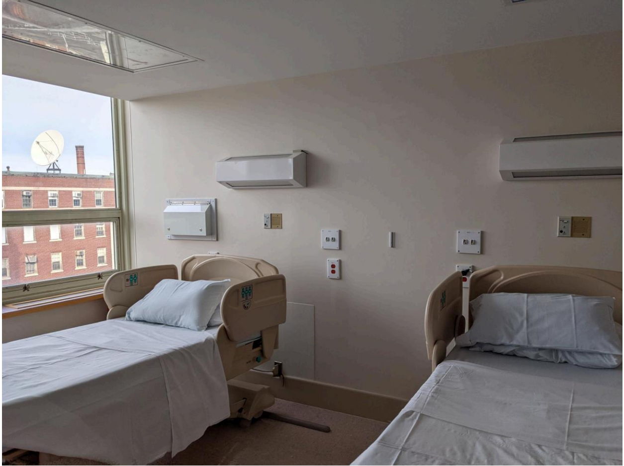
Exhibit 2.8 Interior view – patient room at Our Lady of Fatima