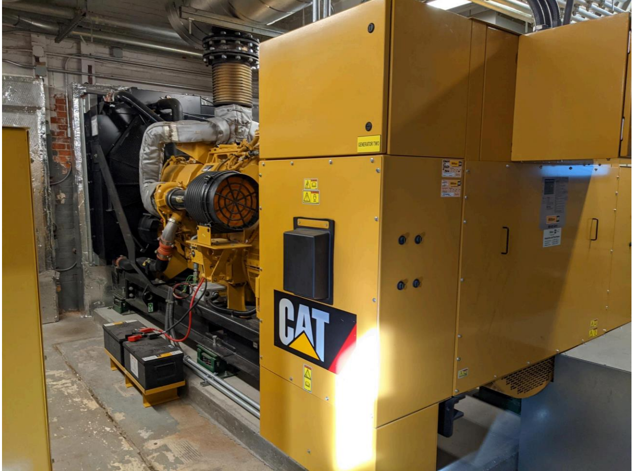
Exhibit 2.9 Interior view – emergency generators at Our Lady of Fatima Medical Center