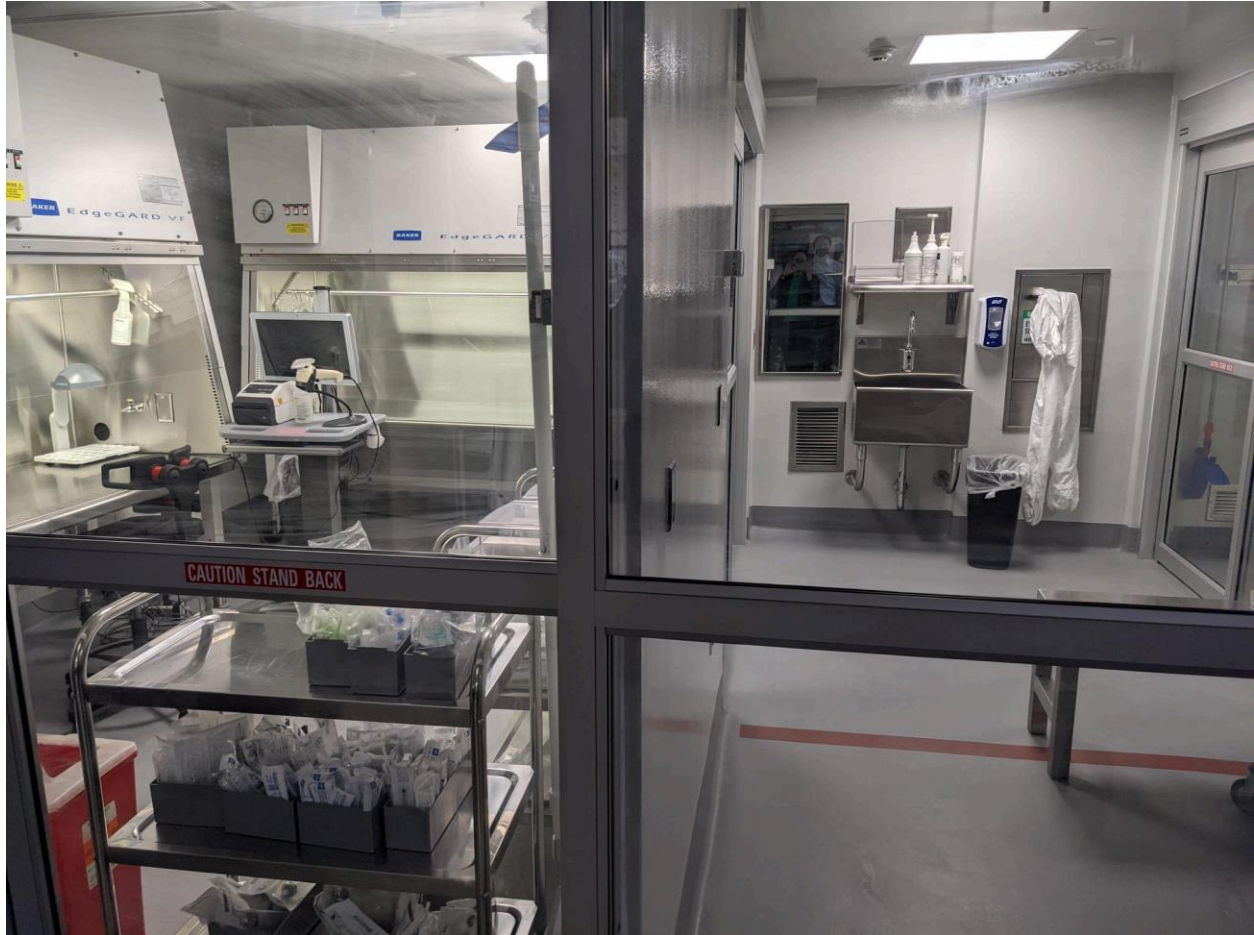
Exhibit 2.7 Interior view – pharmacy at Roger Williams Medical Center