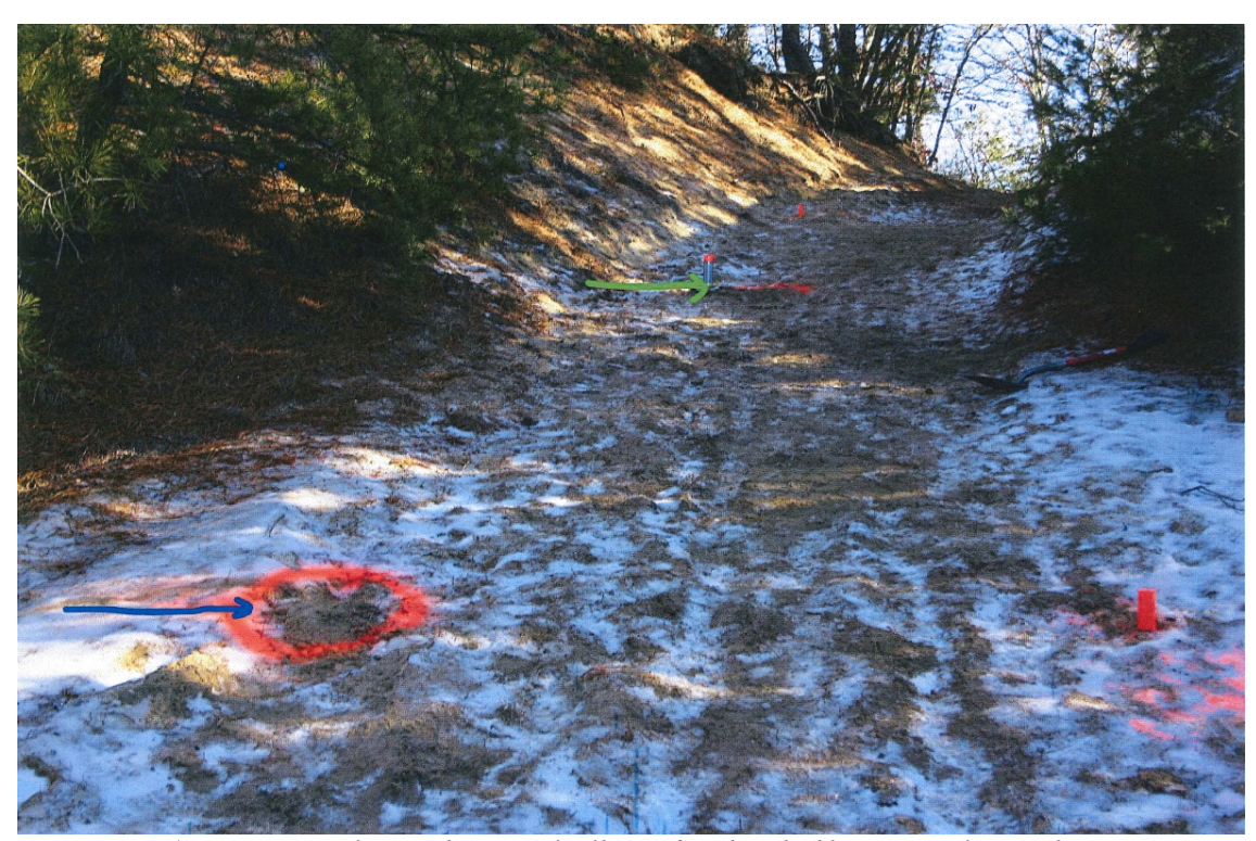
A green arrow points to where a projectile was found, and a blue arrow points to where the cartridge case was found during DEM's search on December 23, 2019.

On December 23, 2019, DEM Lieutenant Daniel White returned to the site of the incident with Captain Steven Criscione and Deputy Chief Kurt Blanchard and conducted a further search of the area with the aid of a metal detector. A cartridge case was found in the soft sand, approximately two inches below the surface. Several feet up from the location where the casing was found, they located a deformed copper jacket of a bullet and a lead core. These items were turned over to the Rhode Island State Police. Subsequent analysis by the Rhode Island State Crime Laboratory concluded that the discharged cartridge case had characteristics that matched all discernable class characteristics of the test fired cartridge case from Officer Hill's weapon. The deformed projectile fragment was in such condition that it was not amenable to identification or comparison.